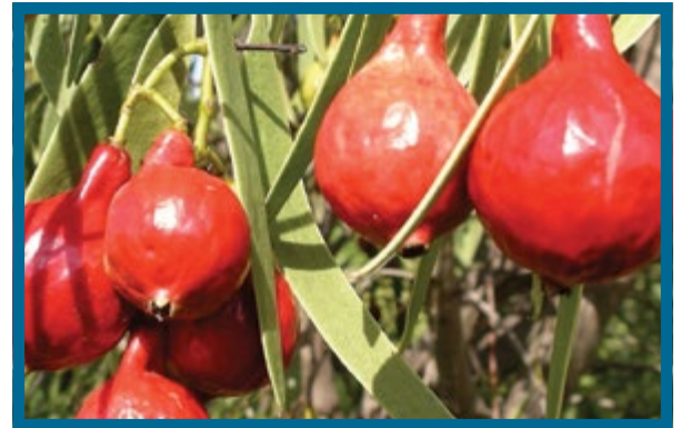
Quandong on tree

Quandong is closely related to the arid zone sandalwood and, although the good-quality timber of the quandong tree is prized as a craft wood, it lacks the fragrant essential oils derived from the timber of many related species. The seed has also been used as a substitute in marble-based games such as Chinese checkers.